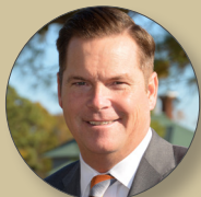
Brad Garrett Kingsmill Resort & Golf Club